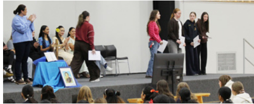
Celebrating Champagnat Feast Day at assembly this morning, where dedicated students received their Bronze and Silver Certificates for the Duke of Edinburgh Awards

At Marist College, we strive to live these messages each day in the life of our school. This is reflected in our classrooms, in our learning, and in the environment we create together. It is seen in moments of prayer and celebration through school and class Masses, in the service opportunities that invite students to look beyond themselves, and in our commitment to balanced, blended learning that values both digital tools and genuine human connection. It is evident when we consciously put our phones aside to be fully present to one another, building meaningful relationships. We strengthen our sense of community through connections with whānau at events such as our Family Festival and College gatherings, where we come together in faith and friendship. In all these ways, we continue to walk alongside our young people, helping them to discover who they are, their place in the world, and the hope that lies ahead.