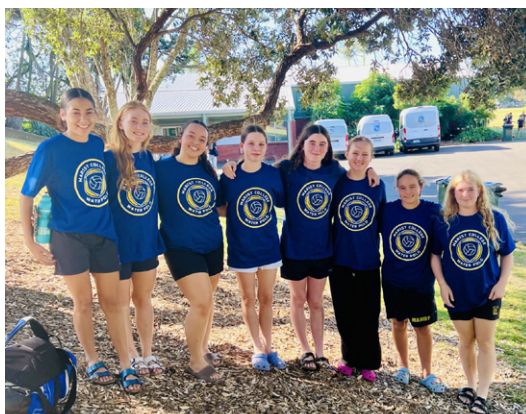
Waterpolo team