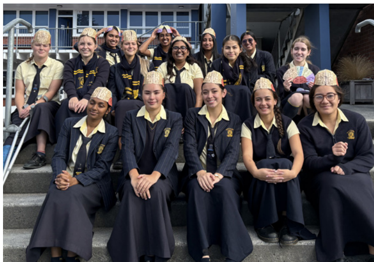
Pictured above, Year 13 Biology students with their 'brain hats' they made for their Trends in Human Evolution studies this week.