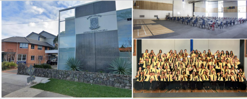
Year 13 student prank only - School not actually for sale