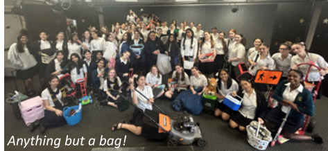
Anything but a bag!

Spirit Week is a special opportunity for our Year 13 students to celebrate their final year at school by engaging in acts of kindness that bring joy and fun to those around them. It has been heartening to witness the emotional journey these young women undergo as they prepare to leave the College. While we will formally bid them farewell next week, I would like to take this moment to thank them for their leadership and presence. They have all led with the grace of Mary and embodied the Gospel Values through their actions.