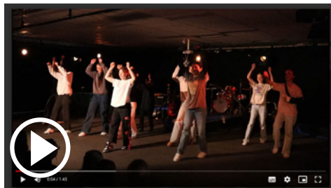
Video of 2024 Performing Arts highlights

On Thursday we also celebrated the Performing Arts at Marist College with our Performing Arts Awards evening. This was a wonderful opportunity to recognise the talents and achievements of our students - congratulations to all our prize winners. 2024 has seen the introduction of new opportunities such as performing on the Hip Hop stage at AIMS Games and the Bollywood Showdown. Next year promises to be just as exciting for the Performing Arts with the annual St Peter's College and Marist College school production being announced sometime next week! Keep an eye out on our school social media accounts and upcoming newsletters for the exciting announcement. You will also find details on where to sign up for the audition pack for what will be a fantastic 2025 production!