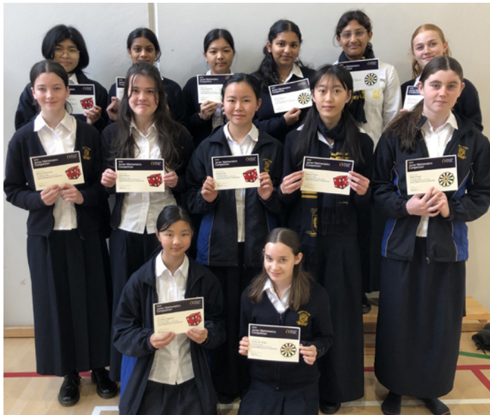
Congratulations to our Otago Maths Competition Winners