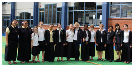
A volunteer group of happy students enjoyed themselves yesterday at break time, being models for an international marketing campaign photo shoot.