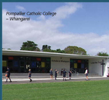
Pompallier Catholic College – Whangarei