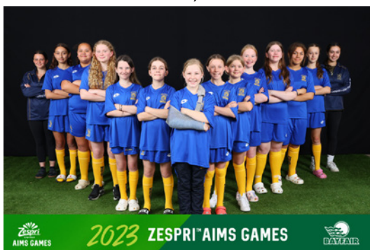
AIMS Hockey team