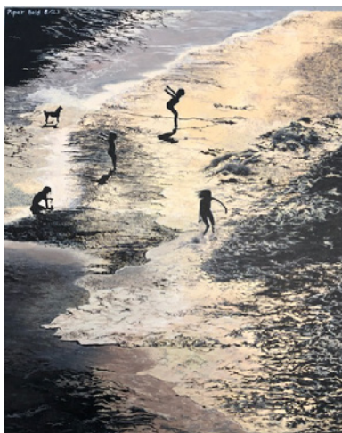
'Perspective' by Piper Bold