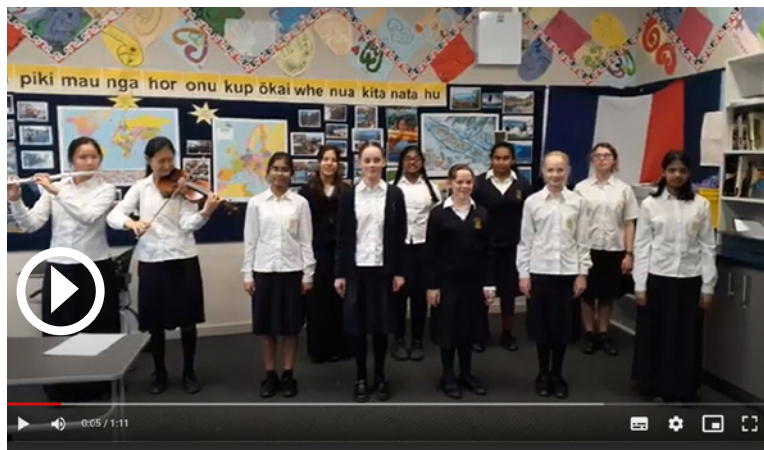
French students singing their talent show item 'On écrit sur les murs' by Kids United