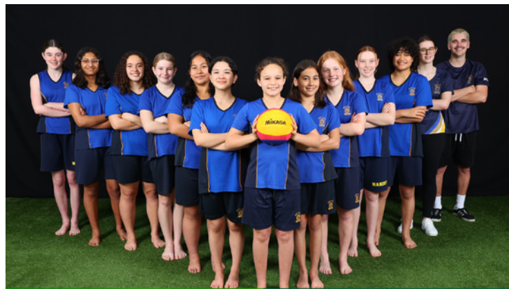
AIMS Waterpolo team