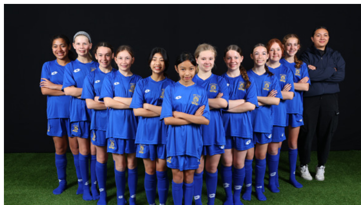
AIMS Football team