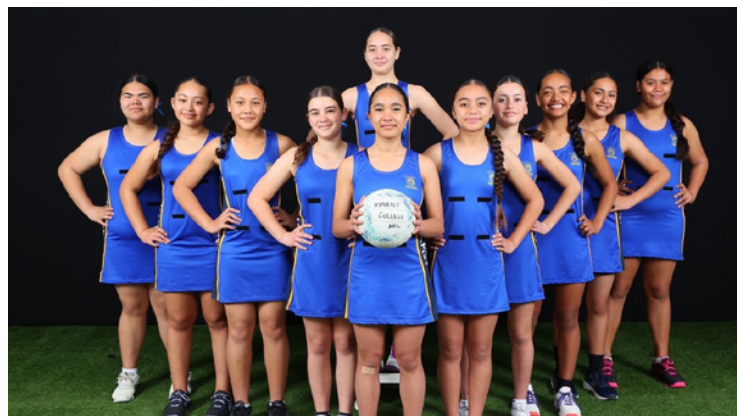
AIMS Netball team