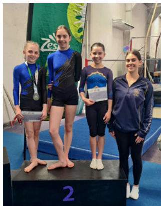
AIMS Gymnastics team