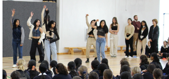
K-Pop Dance Group