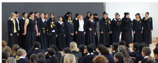
Confortare per Mariam Choir