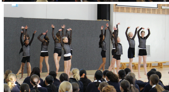
Y7 & 8 Dance Group