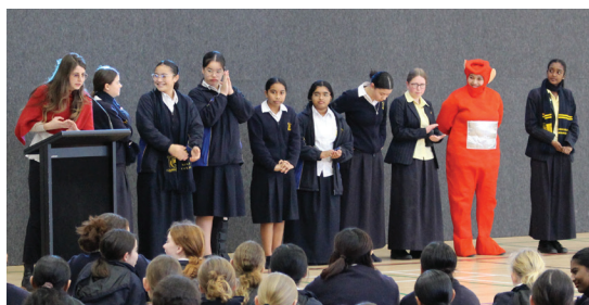
Singing cup finalists