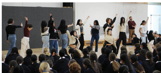
K-Pop Dance Group