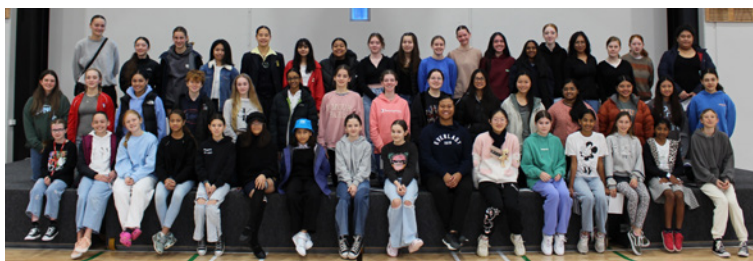
Term 2 Te Ara o Mēri award winners