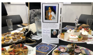
95th Jubilee celebrations