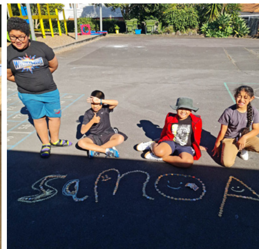
St Dominic's Catholic Primary School coin trail fundraiser for SVSG