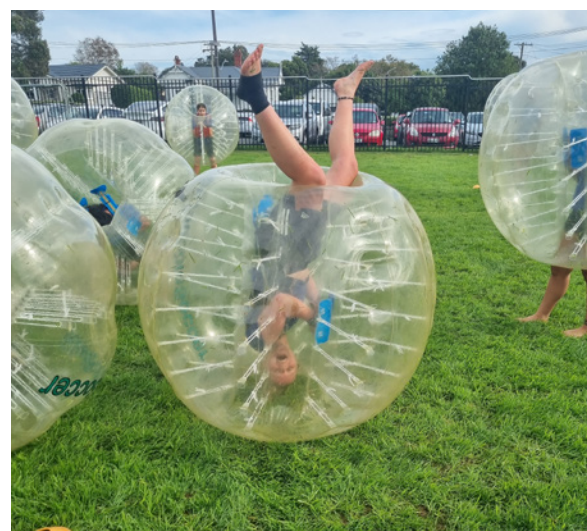
Year 11 PE enjoying some bubble soccer!