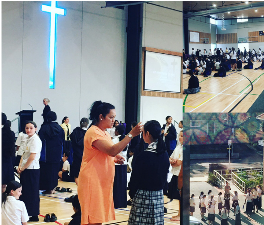
Students receiving a blessing for Ash Wednesday during the Liturgy Service. Pictured here is one of the Y11 international students receiving the blessing.

Any questions? Contact e.brown@maristcollege.school.nz