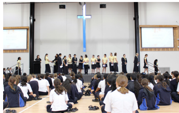
Academic Assembly certificate presentation