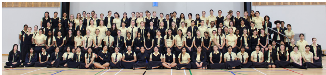
Level 1 and 2 Merit and Excellence Endorsement students

Term 1 - Number 3 Friday, 24th February 2023