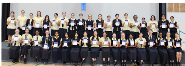
Level 1 and 2 Excellence Endorsement students