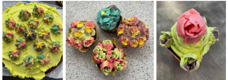
After learning about food and nutrition during the year, students enjoyed experimenting with buttercream icing and Russian decorating tubes with interesting results.