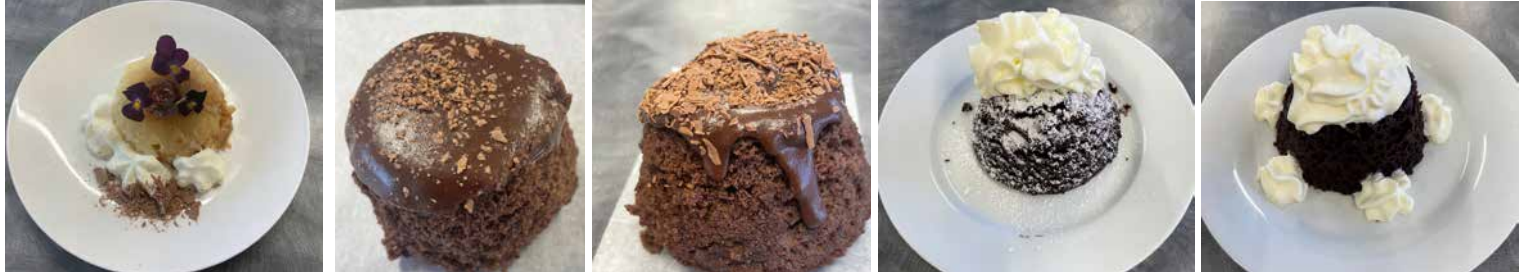
Y8HEC class have made a variety of desserts and cakes in a microwave oven. The pros and cons of this cooking method as well as the chemical interaction of ingredients in the products have been investigated by the girls.