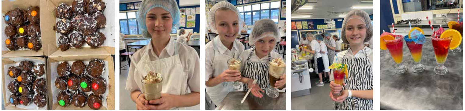
Christmas sweets made by 7HEC.