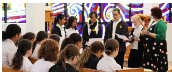
Class Masses held at St Mary's church on Thursday mornings