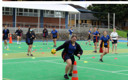
A variety of activities enjoyed at Year 9s Mataranga Māori Day