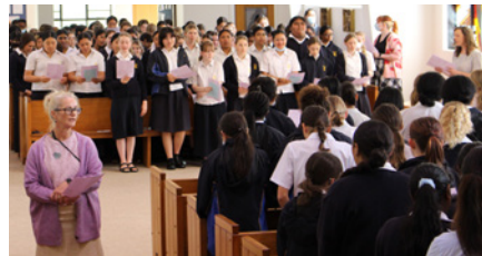
Junior school assemblies held at St Mary's church while NCEA exams take place in the gym